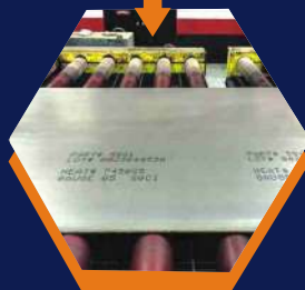
Marking & Stamping