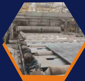
HT (Annealing / Tempering)