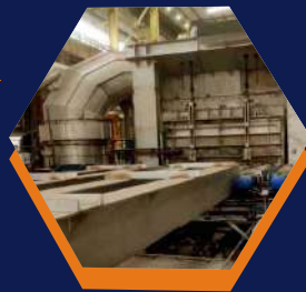
Walking hearth furnace