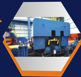
High pressure descaling